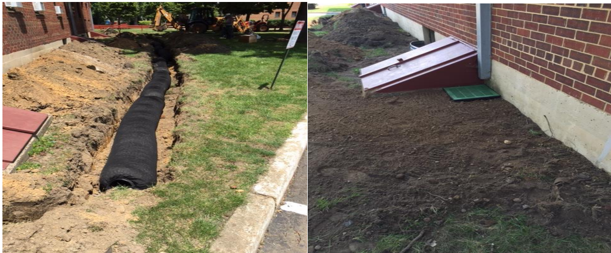
Installation of pervious lateral trenches to distribute storm water runoff into the soil.

Monitoring and compliance of the water saving measures will be ongoing to insure the devices are in place and operating efficiently.