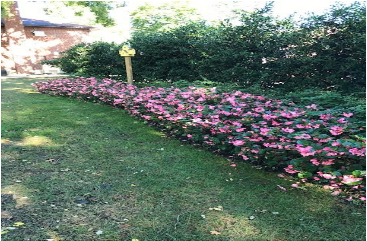
Annual Plantings and Bird Houses