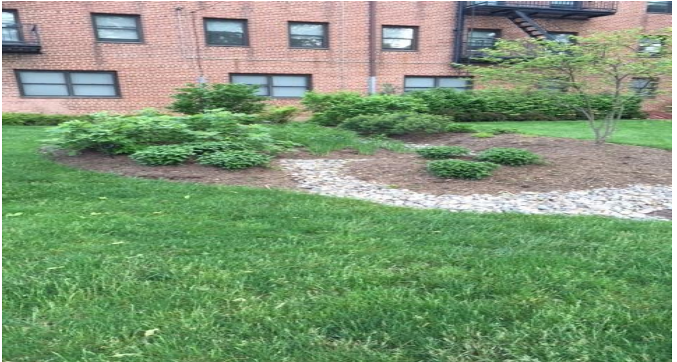
Building 2 Rain Garden