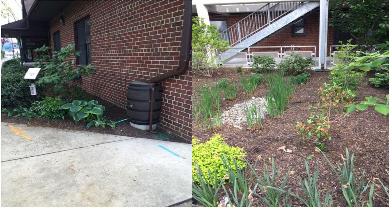
Rain Barrels at the HHA office