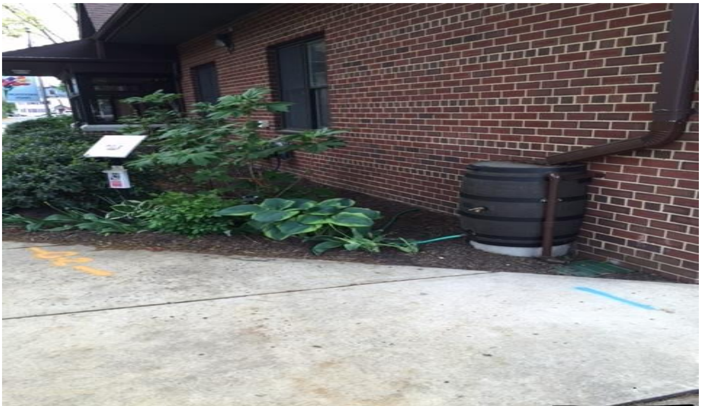
Rain Barrels with percolating trenches